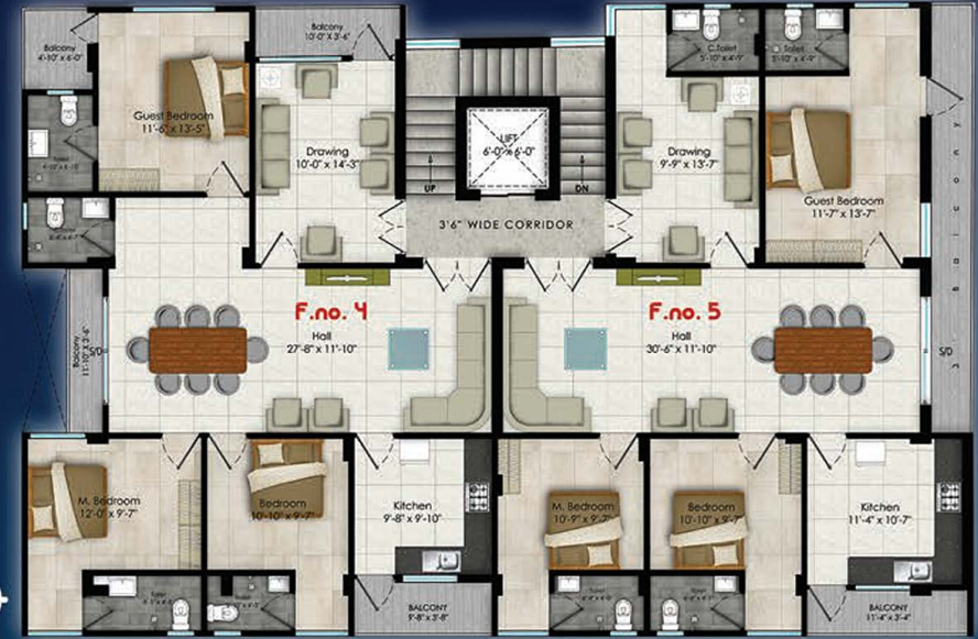
Typical Floor Plans 2 nd & 3 rd Floor