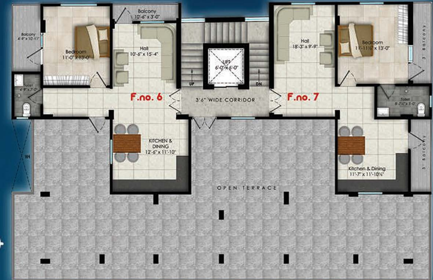
Pent House Floor Plan