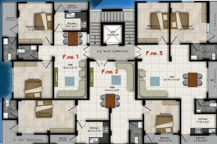
Typical Floor Plans 1 st & 4 th Floor